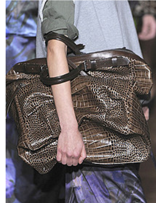
Dries Van Noten

Classically elegant and updated high-end leather accessories were shown in luxurious exotic leathers throughout the collections. Small-scale snakeskin, alligator and ostrich are the key exotic leathers for this season and work well for the overall reworked prim vintage trend for women's accessories noted during Paris this season.